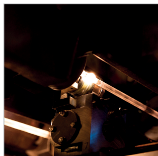
P-VIP® bulb forming

Original OSRAM P-VIP® lamps fulfill the requirements of the projector and the OEMs. They match the required cooling setup (thus avoiding overheating which may lead to shattering, a short life time, lumen decay) and they provide the correct driving mode (thus avoiding a short life, lumen decay, flickering, wrong colours, shattering) and use the correct ignition parameters. P-VIP® lamps give the highest luminance, the essential prerequisite for efficient projection devices. Furthermore they excel through long operating life and a low loss of luminous flux during that life. PT-VIP lamp drivers, perfectly tuned to the lamps, ensure not only optimum operating conditions but also provide additional functions appropriate to the device. Sophisticated UNISHAPE® operating modes offer variable light colour optimised for data, video, and other projections.